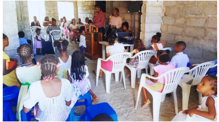
Church plants in Cutelinho (above) and Salina (below)